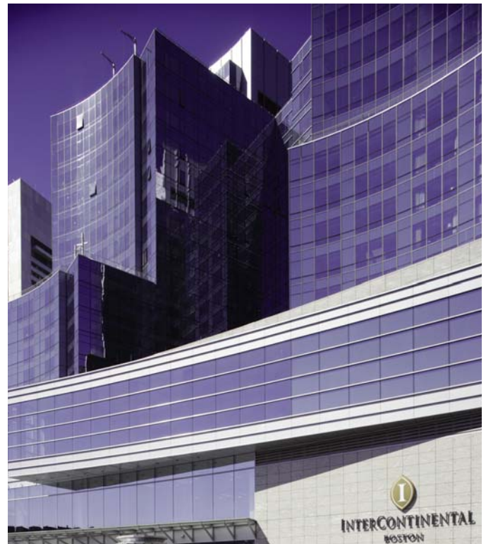
This building is equipped with Galvaspan™ back pans behind the aluminum panels. Intercontinental Hotel, Boston. Elkus Manfredi Architects Ltd.