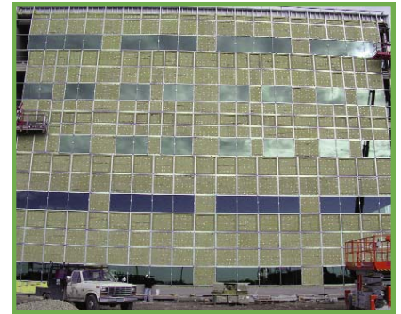
This facade shows insulation pin welded to back pans prior to being covered with metal wall panels. Alberta Children's Hospital, Calgary, Alberta. Kasian Architecture.