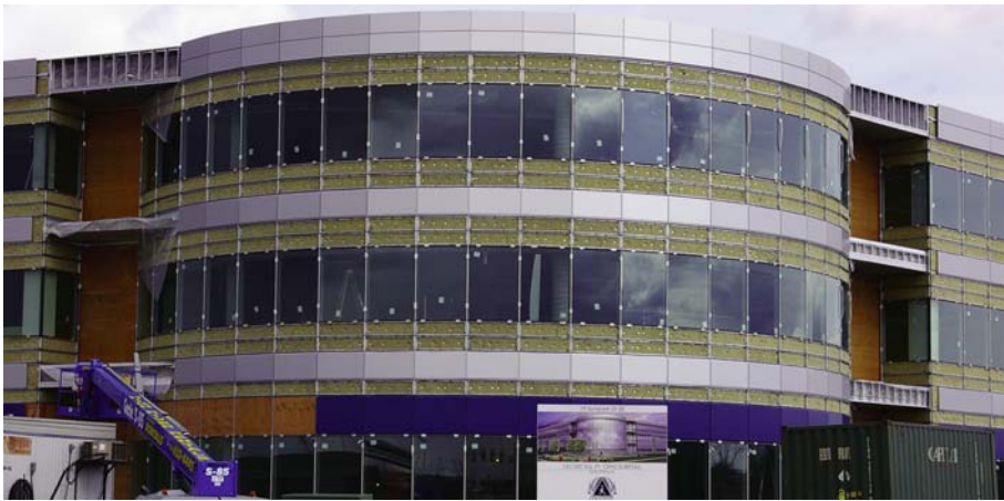
Galvaspan™ back pans (covered with insulation) used in curved wall application. Sundance Plaza, Calgary, Alberta. Manu Chugh Architects.