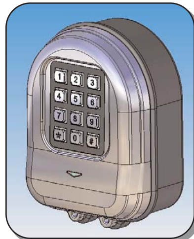
Wall Control Unit