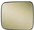
Satin Brass (606)