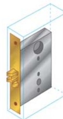
Mortise - ANSI Grade 1