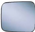
Satin Chrome (626)