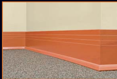
6" Wall Base shown with optional base shoe.

As with all Kwalu wall protection products, our wall guards and wall base offer the rich, warm texture of wood with the Virtually Indestructible™ durability of our proprietary polymer. Kwalu wall guards and wall bases have an anti-bacterial finish. Coordinate your base and chair moldings with other wall protection products for a complete design.