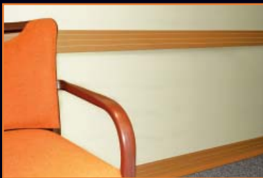
4" Wall Guard shown with Wall Base and Kwalu Symphony Chair.