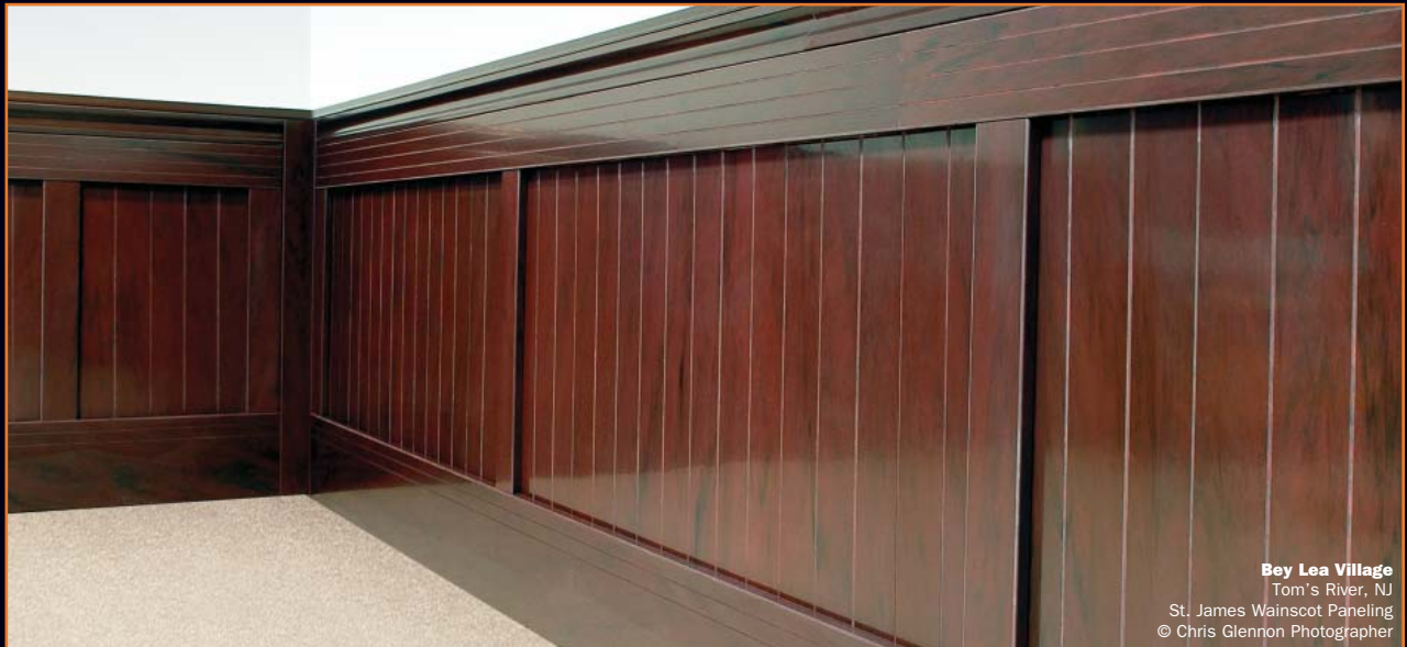
Bey Lea Village Tom's River, NJ St. James Wainscot Paneling