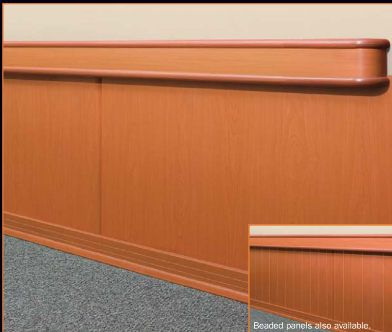
Beaded panels also available.

Kwalu Rigid Wall Covering shown with optional Transitional Handrail, 4" base rail and base shoe.