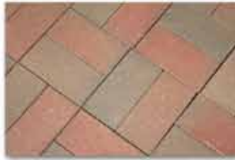
ADMIRAL FULL RANGE