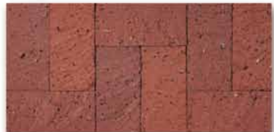
PAWNEE RED PAVER