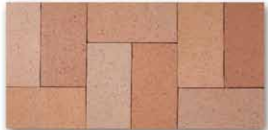
MADRID BLEND PAVER