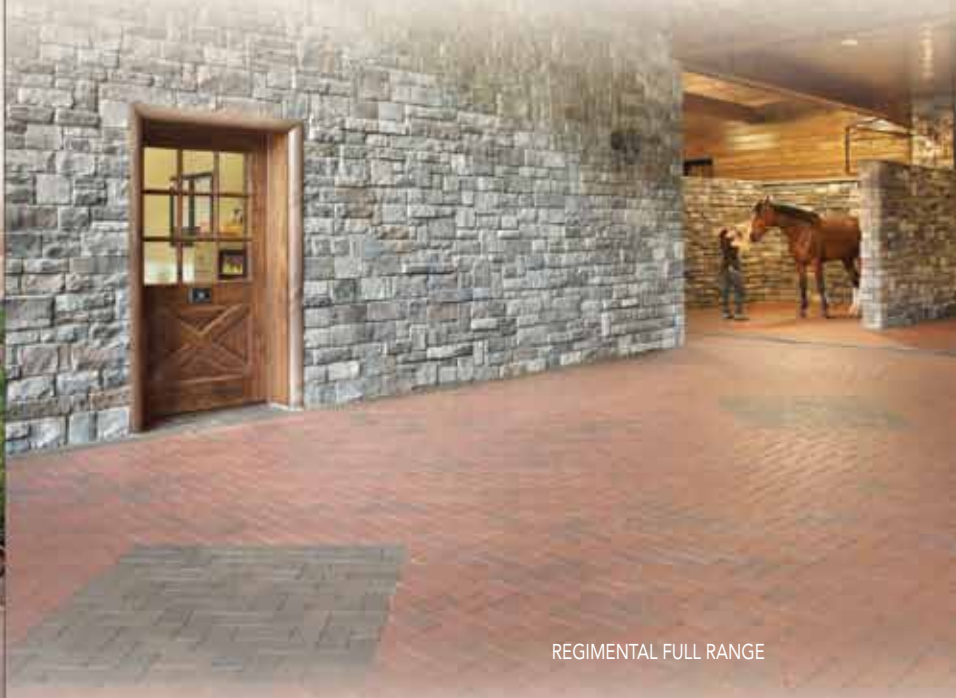
REGIMENTAL FULL RANGE

Express your vision of comfortable living with brick pavers. Brick walks, patios and driveways add character, charm and color permanence no other paving material can match.