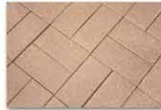
CHESTNUT HILL CLEAR