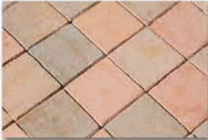
CORAL REEF 3510