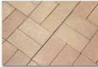
CHESTNUT HILL FULL RANGE