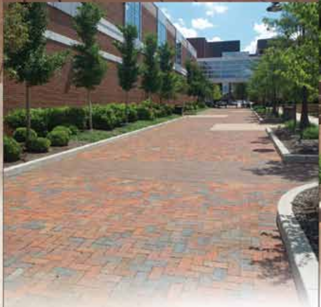
TOP PHOTO: 470-479 MEDIUM & CLARET