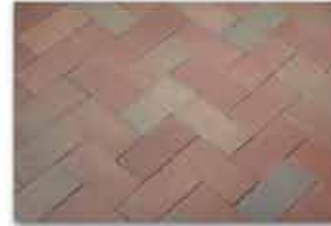
CLARET FULL RANGE