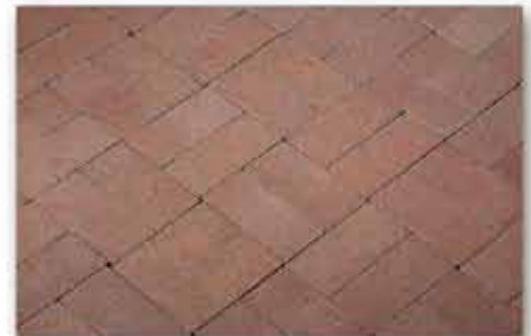
470-479 DARK RANGE SMOOTH