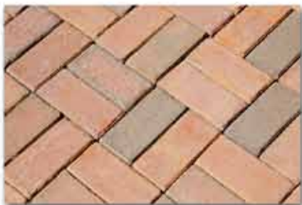
CORAL REEF 3510