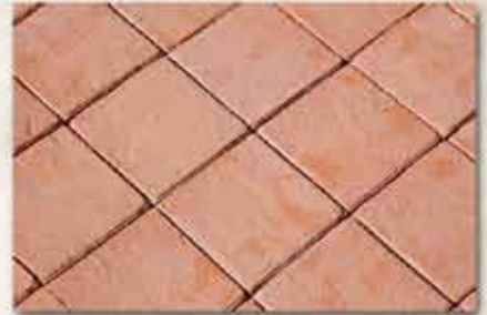
SALMON RUN 3500