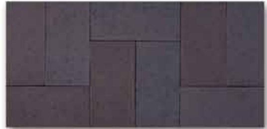
EBONY BLACK PAVER