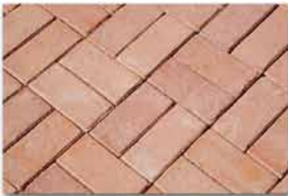
SALMON RUN 3500