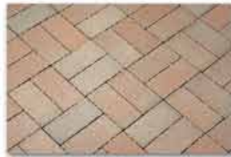
NUTMEG FULL RANGE