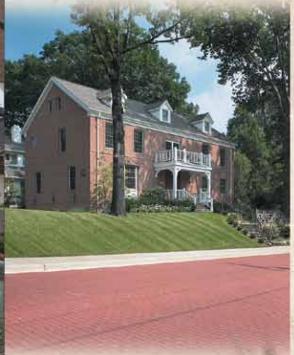
ABOVE LEFT: SIENNA BLEND