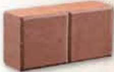
4" X 4" PAVER