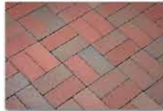
REGIMENTAL FULL RANGE