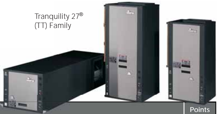
Tranquility 27 ® (TT) Family