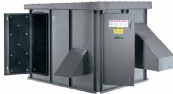
Rx (ERV) Module

Smaller equipment directly impacts building life cycle costs and lowers up-front installation costs. Another LEED point can be added for control of outside air using ClimateMaster's CO 2 sensor to control the Rx ERV module.