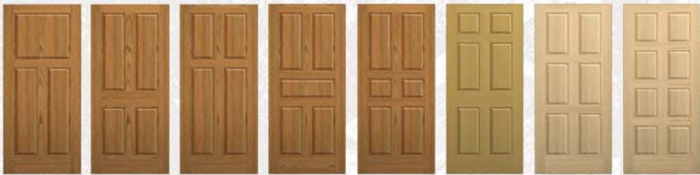
K-5320 K-5400 K-5410 K-5500 K-5600 K-5610 K-5660 K-5810