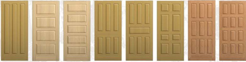
K-3030 K-3040 K-3050 K-3060 K-3070 K-3080 K-3090 K-3120