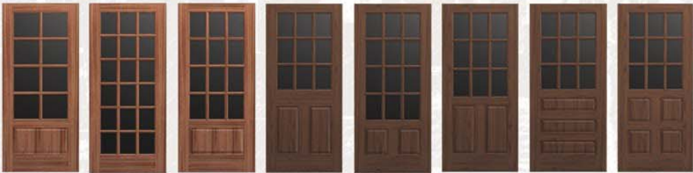
K-3580 K-3600 K-3700 K-3750 K-3800 K-3820 K-3830 K-3840