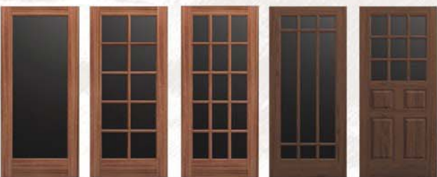
K-6010 K-6020 K-6080 K-6090 K-6510