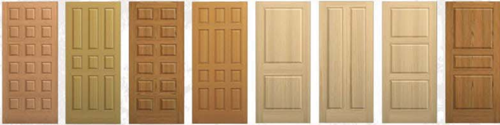
K-3180 K-3190 K-3220 K-3320 K-4010 K-5020 K-5300 K-5310