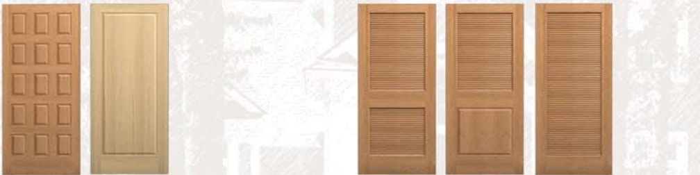
K-5930 K-6000 K-7300 K-7320 K-7330