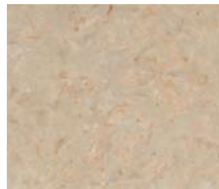
Grey Fleuri Cut

Veine – Veine Cut stone is cut across the bed and exposes the sedimentary (layered) nature of the stone. The “veined” pattern of this cut is exceptionally well suited for sills and coping, but is compatible with all other applications. Veine should not be used in pavers.