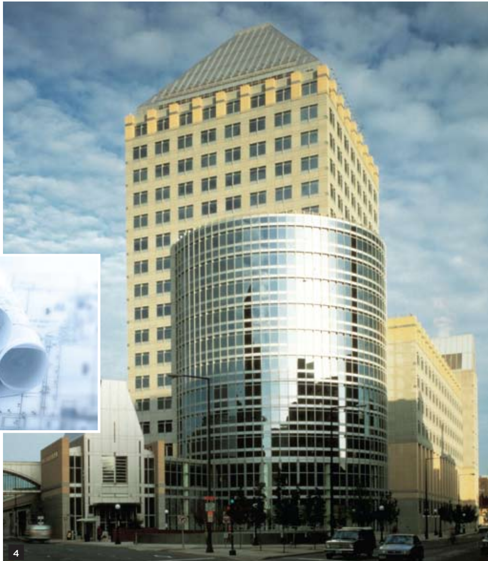
4 La Salle Plaza Minneapolis, MN