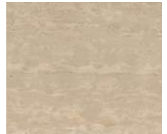
Grey Veine Cut