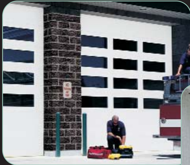
TriCore STANDARD, white, with full-view windows