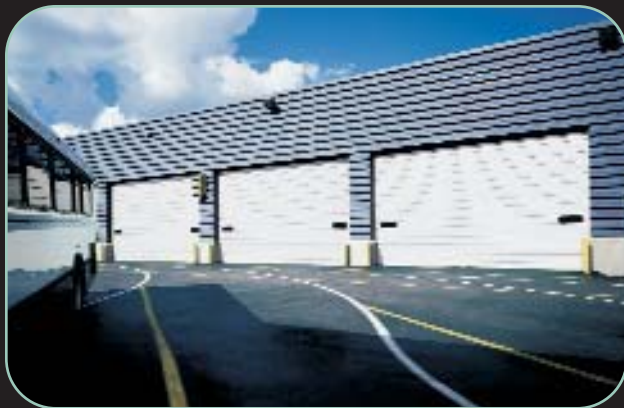
SteelForm STANDARD, white, with oval windows