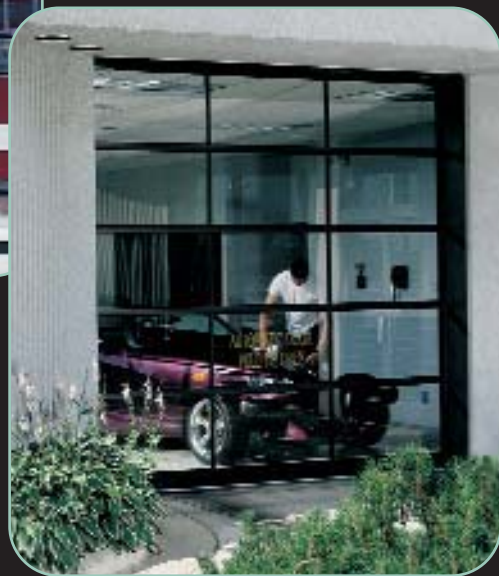
AlumaView STANDARD, bronze-anodized