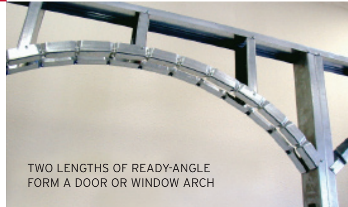
TWO LENGTHS OF READY-ANGLE FORM A DOOR OR WINDOW ARCH

9320 Evergreen Boulevard N.W., Suite G Minneapolis, Minnesota 55433