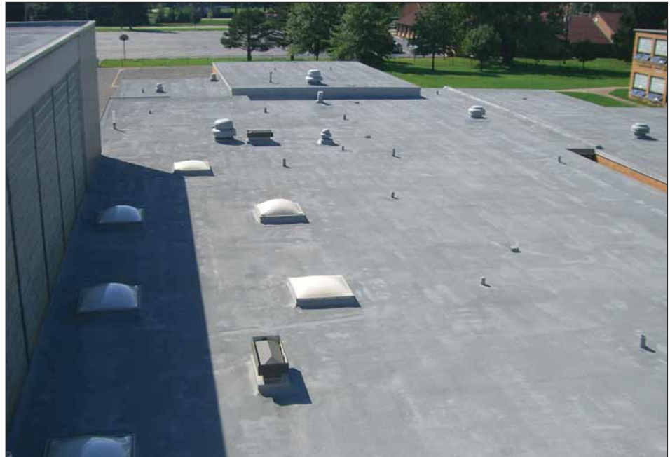
System 14™ Silicone Roof System

impact resistance, this environmentally friendly silicone coating can cure in 2 - 6 hours at normal temperatures