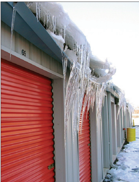
Stop sliding ice hazards