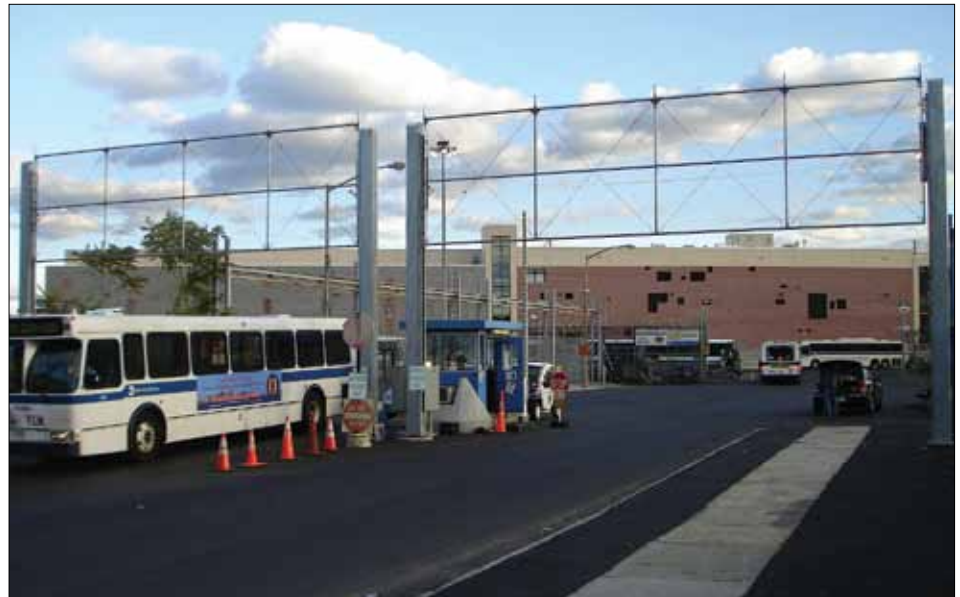
Two HydraLift 20 operators installed at Metropolitan Transit Authority in New York, NY

HydraLift™ is a secure, low maintenance vertical-lift gate operator designed for openings in which there is limited or inadequate space to operate a slide or swing gate or to clear multiple lanes of traffic quickly. Standard HydraLift operator assemblies raise gate panels weighing up to 2000 lb (907 kg) to a height of 16' (5 m), allowing for easy truck clearance. The gate panels are counterbalanced and are controlled from a remote hydraulic panel.