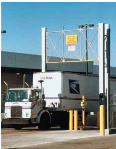
Hydralift 10F opening 30' (9 m) gate panel at 2/second