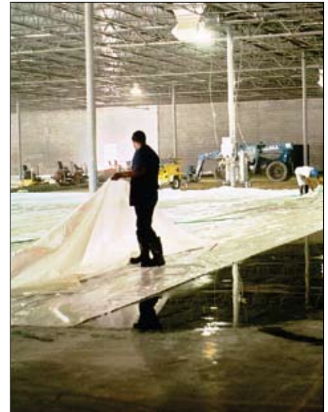
Apply pre-wetted curing covers polyethylene side up.